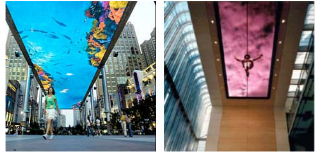
Figure 2. LED display ceiling covering a new shopping mall in Beijing (left) and multimedia sky above the winter garden of the Bertelsmann residence in Berlin (right)

We used mediatecture as one of the foundations for information sky, arguing that projects from this field are based on the same motivation, which is the integration of digital media and architecture. Particularly, it reflects the