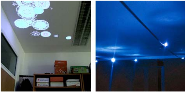
Figure 3. The peripheral weather application showing cold temperature and rainfall (left) and the sound-responsive ceiling display visually reflecting the sound level inside a space (right)

The weather ceiling display represents an example for the category of contextual information . It augments the context of a hallway or any other space where people pass through before leaving a building with information about the short-term weather forecast at the current location. The information is displayed at the periphery of human perception and does not require any user interaction.